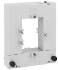
Current transformers DM1TA0600